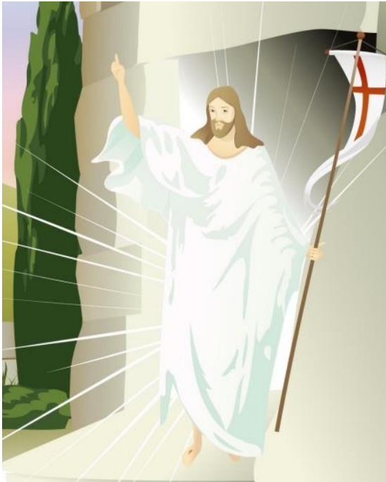
Jesus is risen!