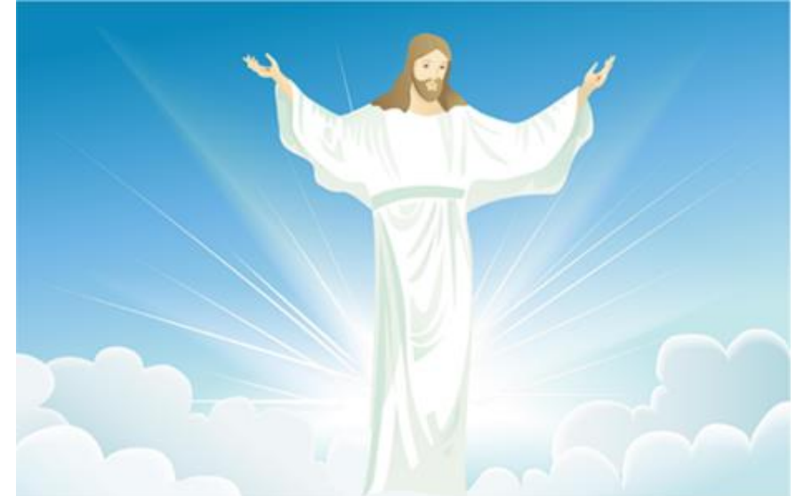
Jesus returns to His Father in Heaven