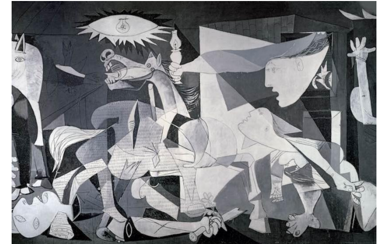
Guernica by Picasso